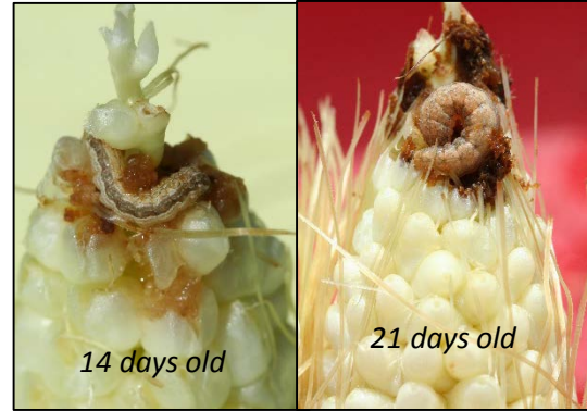
14 days old

Larvae feed primarily on the moist ear tip; their color changes dramatically.