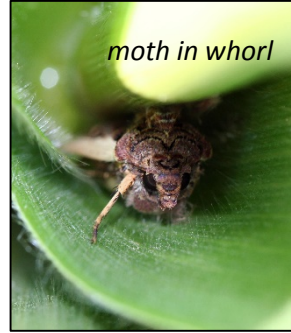
moth in whorl