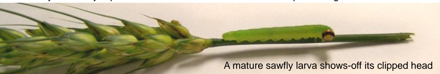
A mature sawfly larva shows-off its clipped head

Grass sawflies can occur at the same time, and in the same fields, as true armyworm, but the two pests differ in color, number of prolegs (true armyworm = 5 pairs, Pachynematus = 8 pairs), and activity time. Armyworms are most active at night and on cloudy days, while sawflies feed during the day. Sawfly larvae feed on leaves of small grains, but more importantly they clip heads. In Michigan in 2010, an increase in head-clipped wheat was attributed to sawflies. Even in mixed populations of armyworm and sawfly, sawflies appeared to be responsible for most of the clipping. One sawfly larva may clip 10 to 12 heads before it matures and drops to the ground.