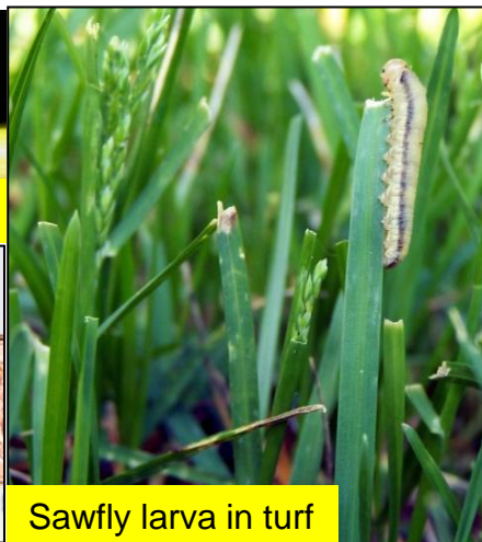
Sawfly larva in turf

Small grains are damaged by sawflies in the genus Pachynematus . Sawfly adults emerge early in the year and lay eggs in April to early May. In the eastern U.S., outbreaks usually occur after an abnormally warm spring creates ideal egg-laying conditions. Young larvae have a light brown head capsule, but older larvae develop a distinct dark stripe between their eyes (described as wrap-around sunglasses or a raccoon mask). Larval development takes 3 to 4 weeks. In June, mature larvae drop to the ground, and spend the rest of the year underground. Adults emerge the following spring (i.e. there is only 1 generation per year). Because this insect pupates and overwinters underground, the increase in reduced and no-till acres in ag production may favor its survival.