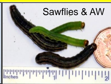
Sawflies & AW