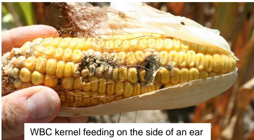
WBC kernel feeding on the side of an ear

Gray shading: Counties trapped for WBC XX: Total number trapped per county Yellow shading: Counties with confirmed WBC damage