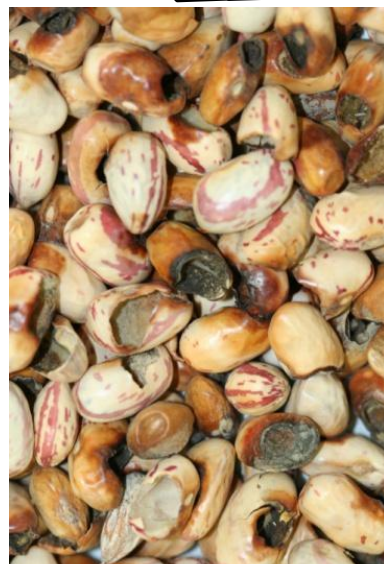
Damaged cranberry beans